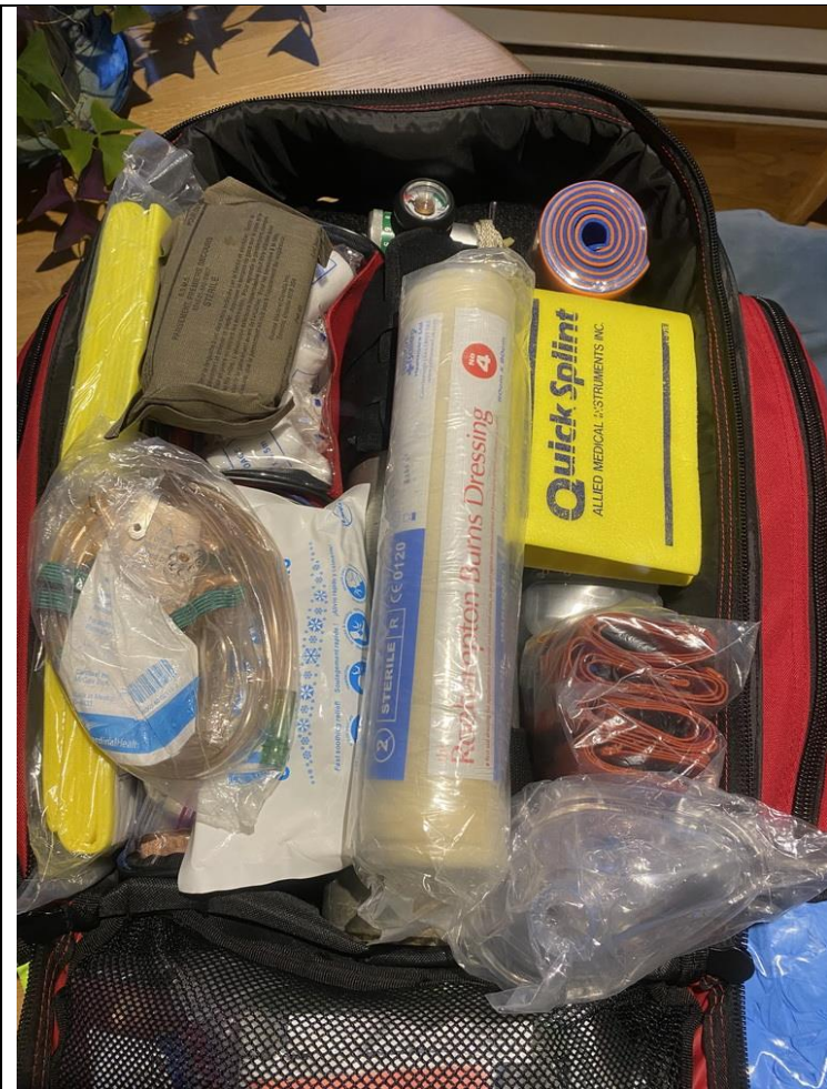
Inside view of main compartment, including the oxygencylinder & regulator.