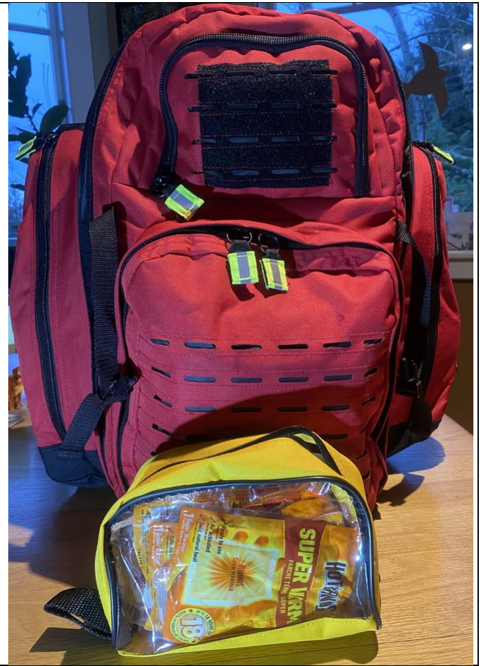
New First Aid Kit (Jan 23) is a backpack style with four external pockets and one Tear-Off (Velcro) Pouch.