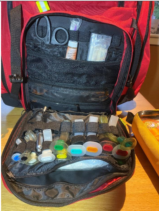
Contents of outside bottom Pouch (airway tubes, scissor, inspection light, glucol, band-aids)