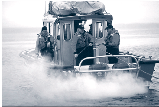
Line handling while towing

The crew is responsible for knowing the location, setup and operation of all emergency and rescue gear. The only way to get familiar with the setup and operations, the tension in the tow line, and any other dangers. Each vessel will have different types and models of equipment.