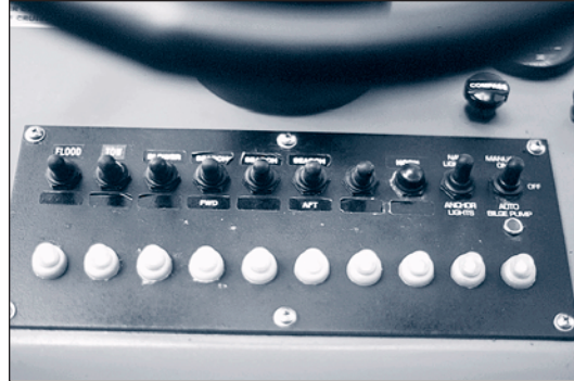
Each crew member should be familiar with controls

All crewmembers should partake in routine maintenance on a rotational basis as it will not only teach the member more about the vessel, but it will instill a sense of ownership and pride in being an integral part of the crew.