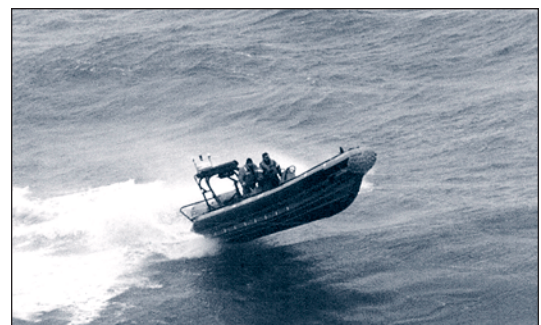
Vessel operating at peak performance requires an efficient team to maintain safety & overall performance

Two factors encourage malicious obedience. The first is a coxswain or captain that is unable to communicate their expectations, thereby getting frustrated and taking over or micromanaging every action on the vessel. The second is a crewmember who forgets the consequences of this brand of mental resignation and lets his/her attention drift to the conflict and not the vessel's mission.