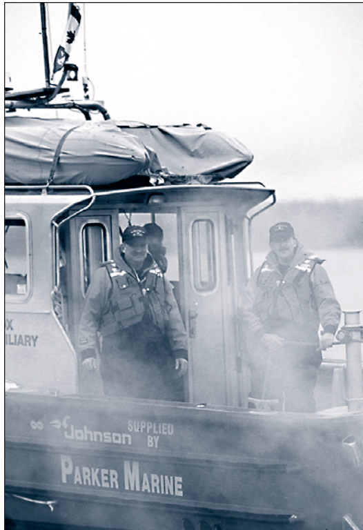
Unit 60 Comox SRU Team

members do what they say they will do, and admit what they are not able to do. Integrity allows the vessel to prosper from her crew's strengths rather than being crippled by their weaknesses.